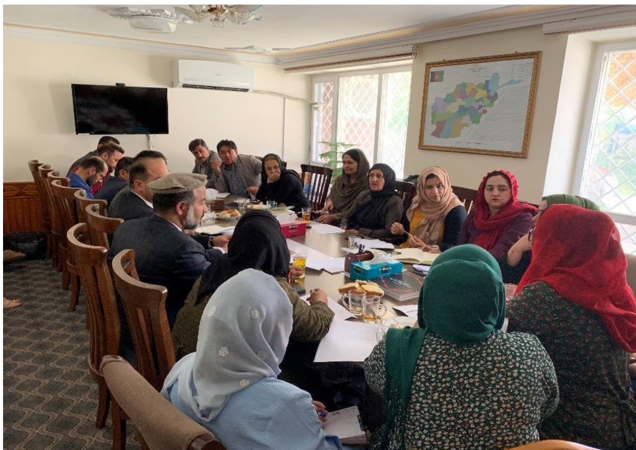
Figure 5, Afghan Shelters Network Meeting, Kabul, 2019

In the mentioned meetings, the agendas of the meetings were prepared based on the request of the WPCs and in the meeting sessions in addition to the WPC's representatives, the representatives from relevant governmental institutions such as Mol, MoPh, MoE, the Attorney General office, the Supreme Court, CEO, Red Crescent, AIHRC, MoWA, MoHaj, MoJ, and other relevant national and international institutions were invited to discuss and find solutions for the ongoing challenges within their authorities. In these meetings, the challenges of WPCs with the mentioned institutions were discussed and, in some cases, proper action in cooperating the WPCs was taken by the relevant authority. In addition, the WPCs were connected to the representatives of the governmental institutions such as PDs, MoPH and Mol to solve their challenges and promote cooperation.