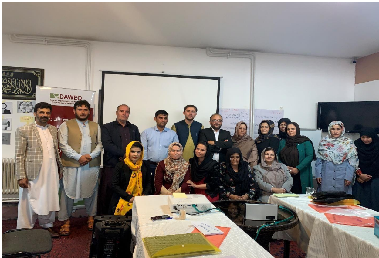
Figure 4 Training for Staff of Ministry of Women Affairs, Kabul, 2019

Over the past years, DAWEO has been successful in bridging the gap between CSOs and the government institutions through ASN and inter- coordination among the two on several occasions. Particularly, DAWEO is responsible for hosting the external ASN meetings since Nov 2015. These meetings have enabled practical solutions for challenges brought up at these meetings. The aim of the ASN meetings is to find possible solutions.