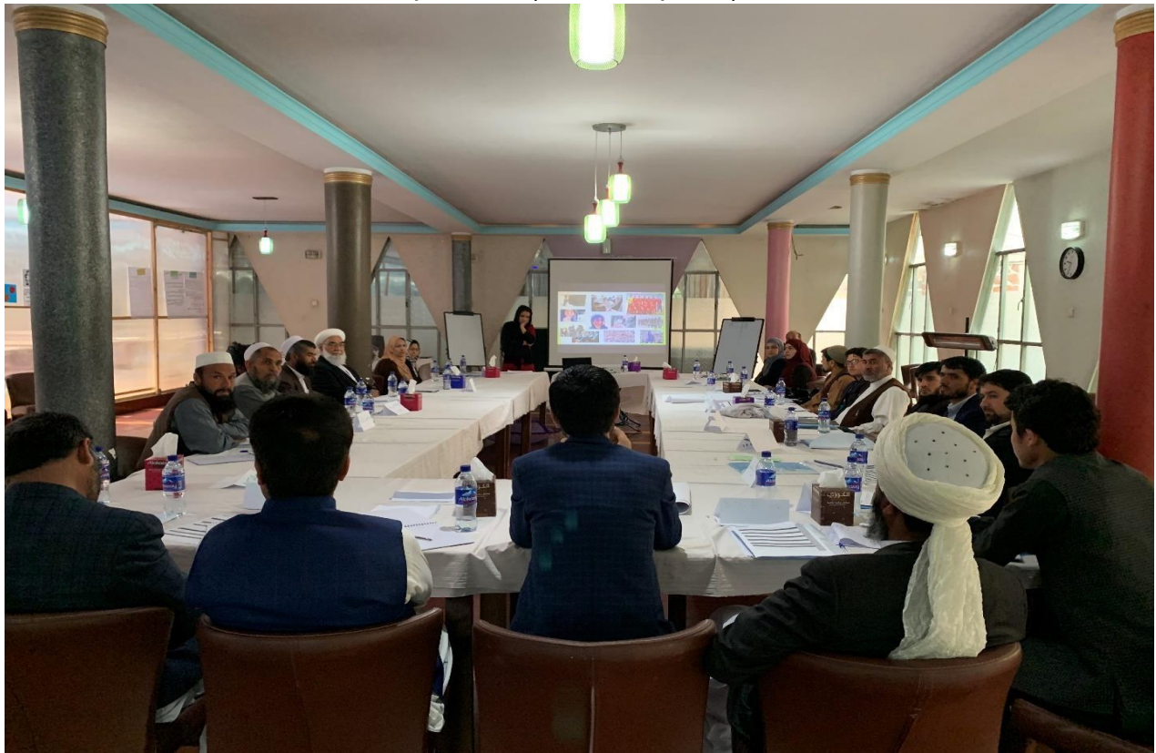
Figure 3 Training for Staff of Ministry of Haj, Kabul, 2019