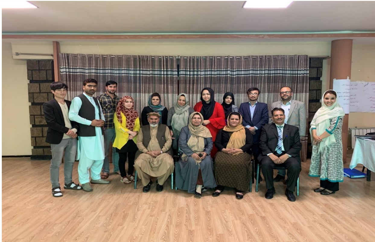
Figure 1 Training for Women Protection Center Staff, Kabul