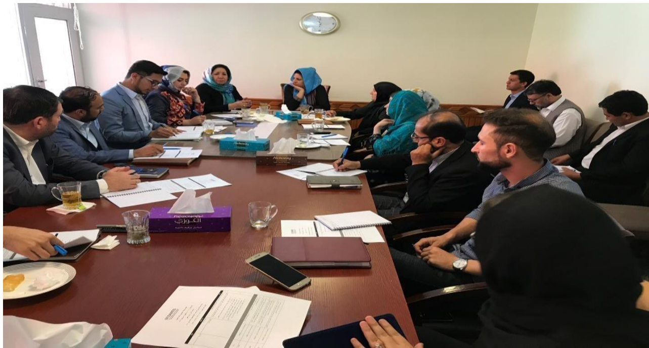
During training for the Staff of Ministry of Women Affairs