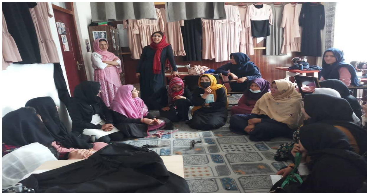
Meeting with mayor representative (wakil-Gozar)- Bamyán 2022