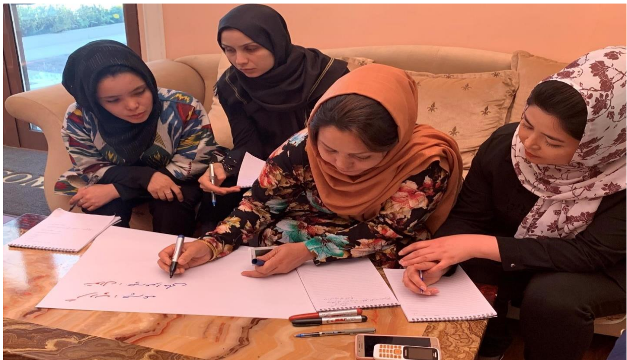
Figure 2 Training for Women Protection Center Staff, Mazar