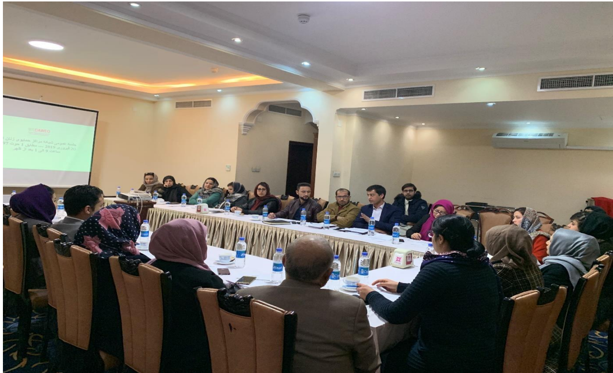
Figure 6, Afghan women Shelters Network coordination meeting, Kabul, 2019

In Addition, DAWEO had activities to raise the public awareness on WPCs services and women rights by holding events. DAWEO held an event in celebration of the international 16-day activism end violence against women on 9th December 2019.